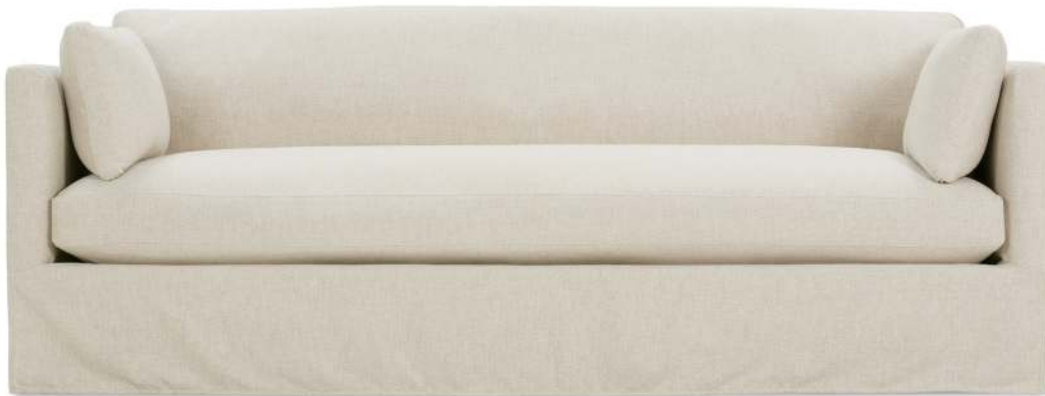
Shown in fabric BU102-28.

MADELINE • SLIPCOVER • LOOSE PILLOW BACK