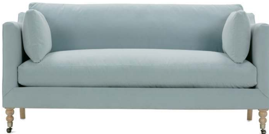
Sofa in fabric VO105-34. Washed oak leg finish and pewter casters.

Madeline-033 Sofa L90" D40" H34" Seat Height 21" Seat Depth 24" Arm Height 29" Width Between Arms 68"