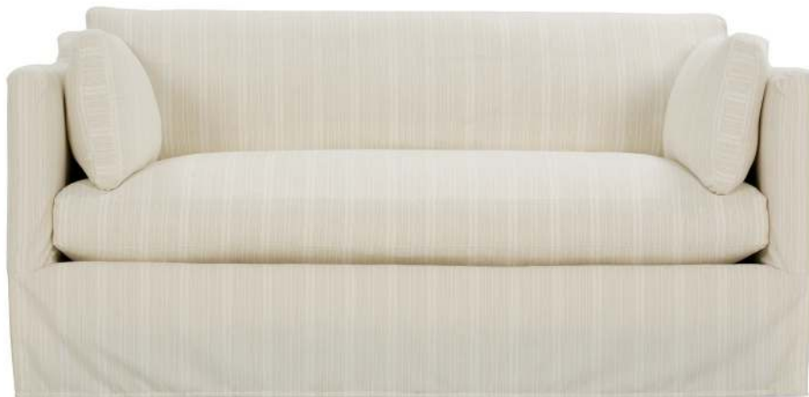
Shown in fabric SA110-50.