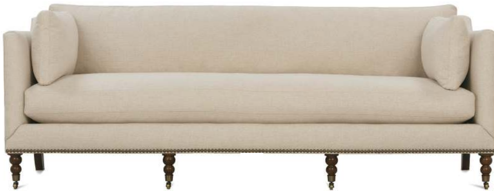
Sofa in fabric 15837-58. Gracious Living leg finish and Brass nailhead and casters.

MADLINE • FULLY UPHOLSTERED • LOOSE PILLOW BACK